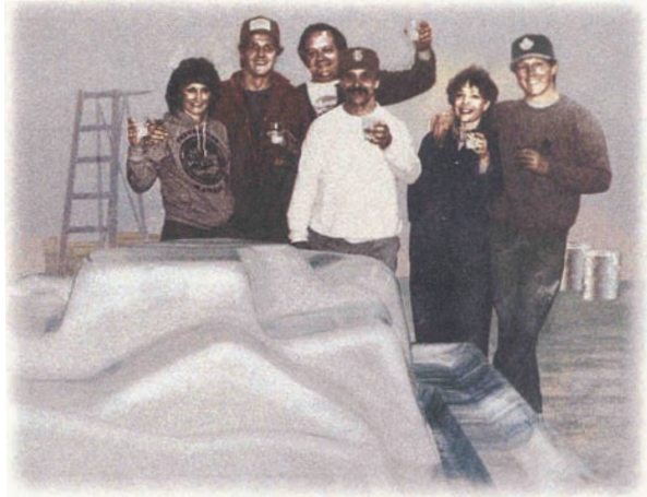
Celebrating the first Beachcomber Hot Tub in 1978.